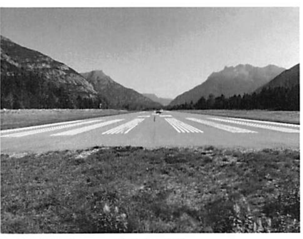
View to East

Different airlines have provided service to the airport since 1966, with Pacific Coastal Airlines (PCA) (purchasing Wilderness Airlines) continuing regular scheduled service to the community since that time.