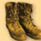
Seasonal clothing and footwear