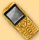
Cell phone with chargers, inverter or solar charger