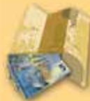
Local maps and some cash in small bills