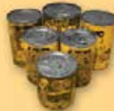
At least a three-day supply of non-perishable food. Manual can opener for cans