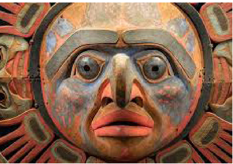
The CCRD recognizes its location within the traditional and unceded territories of the Heiltsuk Nation, Nuxalk Nation, and Wuikinuxv Nation, as well as the Kitasoo/Xai'Xais Nation and Ulkatcho Nation.