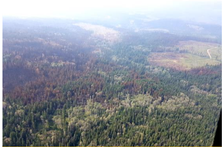
This photo is of the Young Lake fire yesterday afternoon (C42331).

Over the last week, much of the Cariboo Fire Centre experienced some reduced fire activity. We want to remind everyone that fires are still burning on the landscape. We expect to see the weather return to warmer and drier conditions in the coming week and that could cause an increase in fire behaviour again. For homes within the evacuation alert areas, please remain prepared for the potential increase in fire activity. We encourage everyone to take the necessary precautions to protect their homes and communities by participating in the FireSmart program.