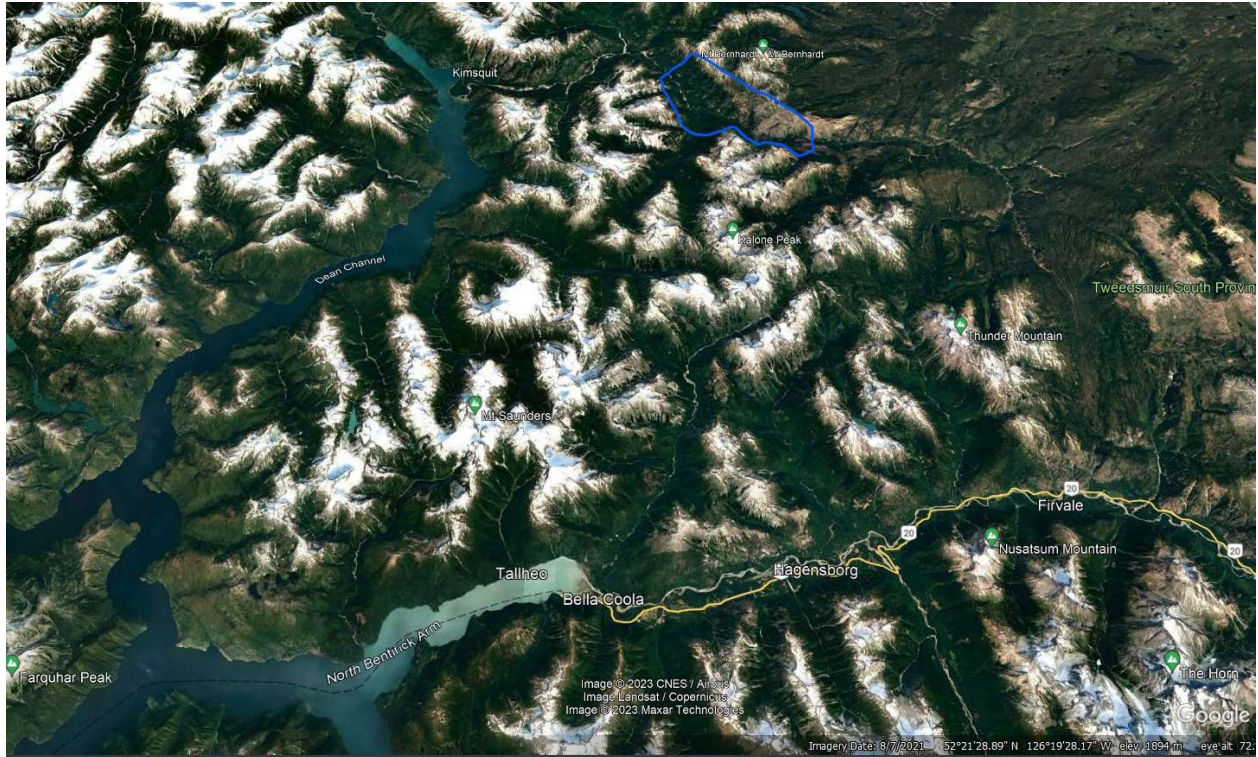
Map A: Evacuation order in proximity to the community of Bella Coola.