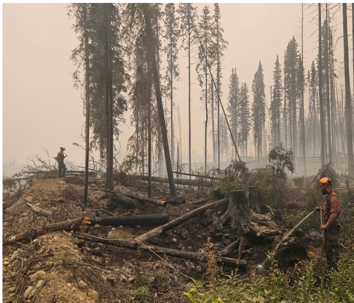
Mop up operations on C51672