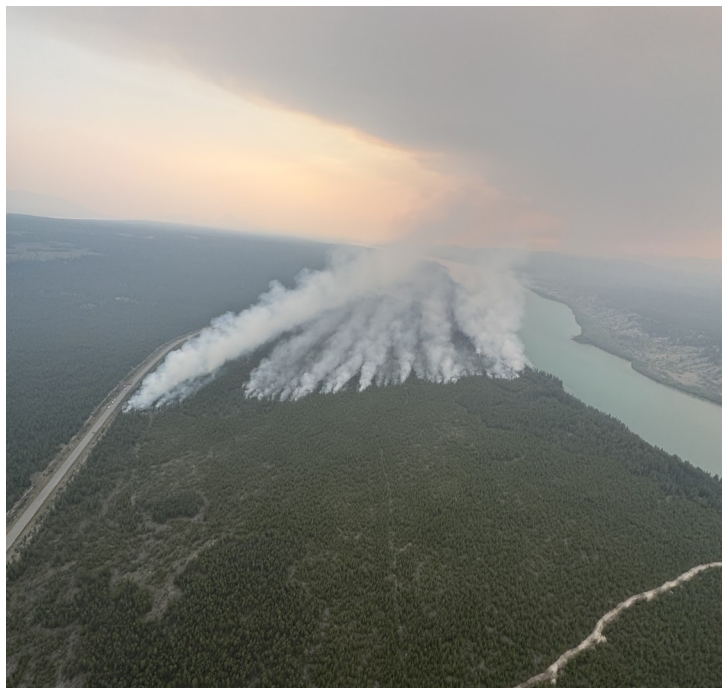
Planned ignitions on C51843 September 4, 2025

Evacuations: Evacuation Orders and Alerts are in effect for this incident. Please visit: https://www.cariboord.ca/en/emergency-and-protective-services/evacuation-orders-alerts-current.aspx