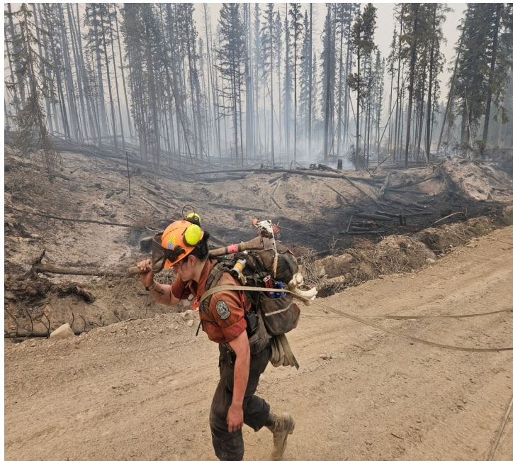
C51672 Crew member moves hose along fire guard.

Evacuations: Evacuations Alerts and Orders are in effect for this incident. Please visit: https://www.cariboord.ca/en/emergency-and-protective-services/evacuation-orders-alerts-current.aspx