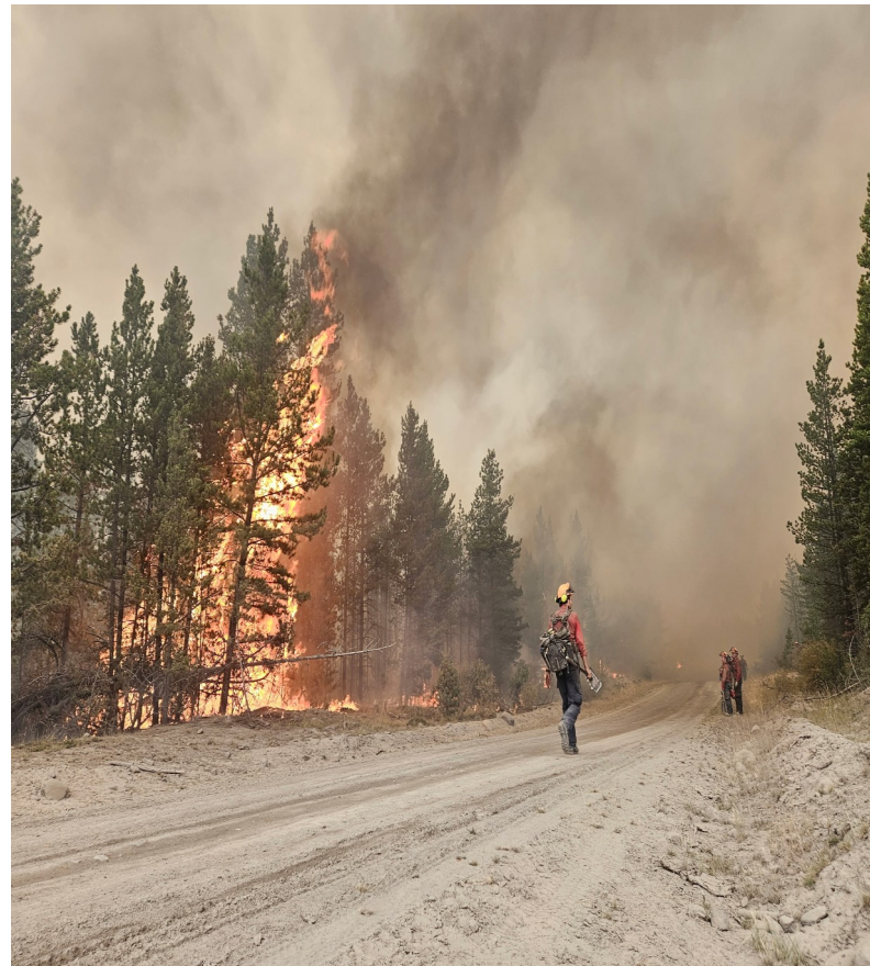
C51880 Planned ignitions on Dusty Dodge FSR September 6, 2025.

Evacuations: Evacuation Orders and Alerts are in effect for this incident. Please visit: https://www.cariboord.ca/en/emergency-and-protective-services/evacuation-orders-alerts-current.aspx