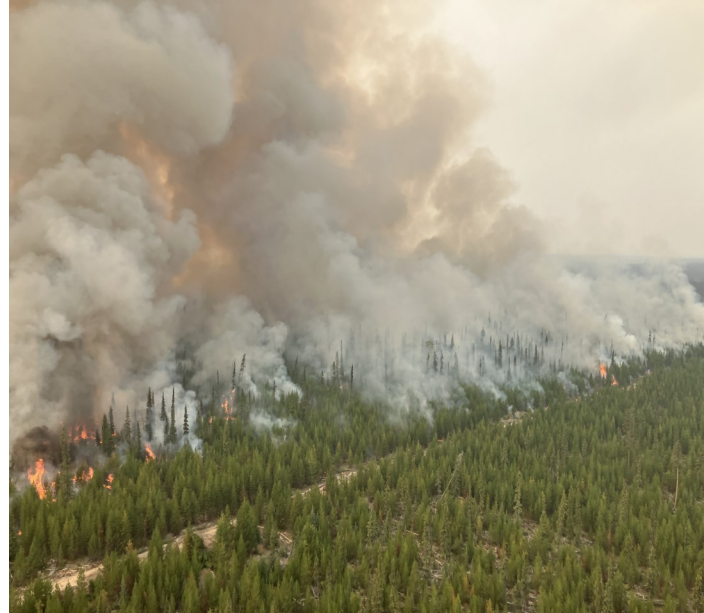
C51672 Planned ignitions September 6, 2025.

Evacuations: Evacuations Alerts and Orders are in effect for this incident. Please visit: https://www.cariboord.ca/en/emergency-and-protective-services/evacuation-orders-alerts-current.aspx