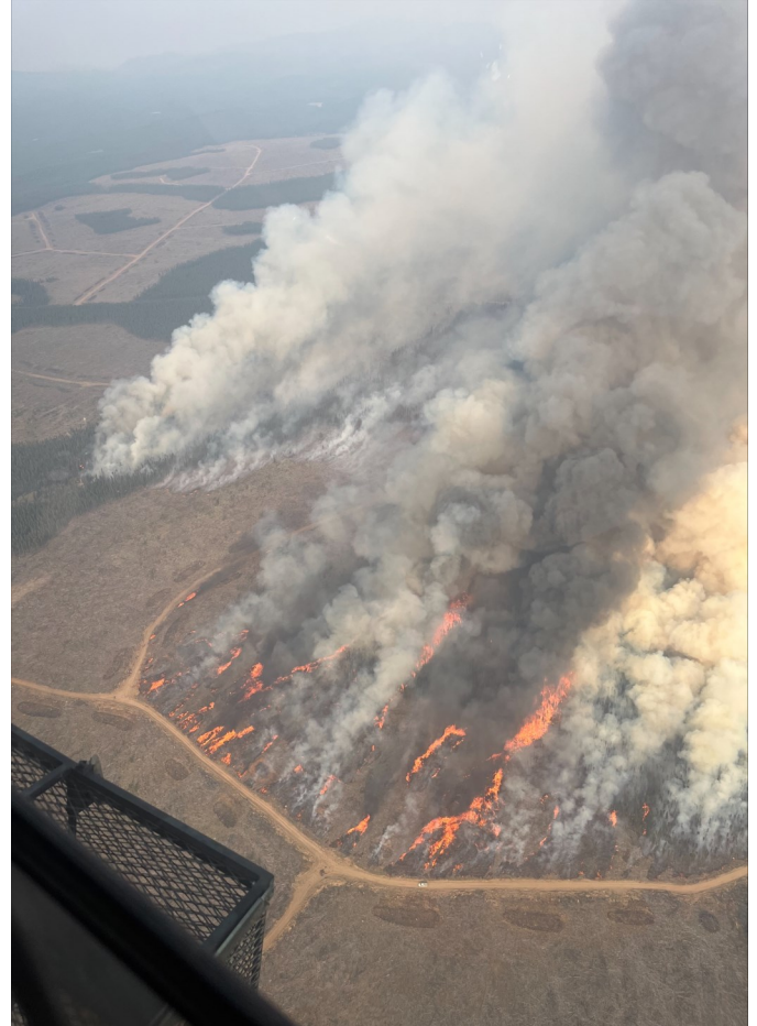
C51738 Planned ignitions on September 7, 2025

Evacuations: Evacuation Orders and Alerts are in effect for this incident. Please visit: https://www.cariboord.ca/en/emergency-and-protective-services/evacuation-orders-alerts-current.aspx