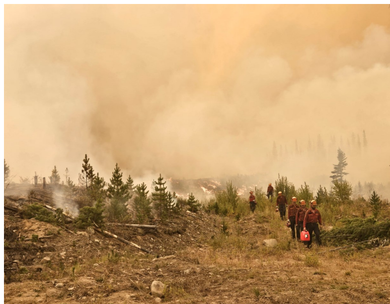
Crew conducting planned ignitions on C51672