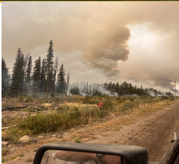
C51672 Planned ignitions September 8, 2025.

When visibility allows, a night vision helicopter has been assessing over-night fire activity on this incident.