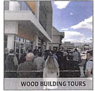
WOOD BUILDING TOURS

Wood WORKS! is a national industry-led program of the Canadian Wood Council, with a goal to support innovation and provide leadership on the use of wood products and building systems. Through conferences, workshops, seminars and case studies, Wood WORKS! provides education, training and technical expertise to building and design professionals and local governments involved with commercial, institutional and industrial construction projects throughout BC. For more than 20 years, Wood WORKS! BC has facilitated practical, efficient, versatile and cost-effective building and design solutions through the use of wood – the most sustainable, natural and renewable building material on Earth.