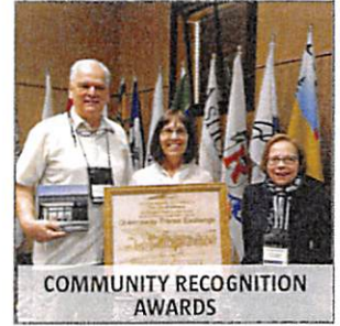
COMMUNITY RECOGNITION AWARDS