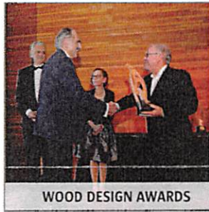
WOOD DESIGN AWARDS