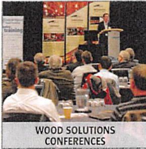
WOOD SOLUTIONS CONFERENCES