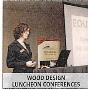
WOOD DESIGN LUNCHEON CONFERENCES