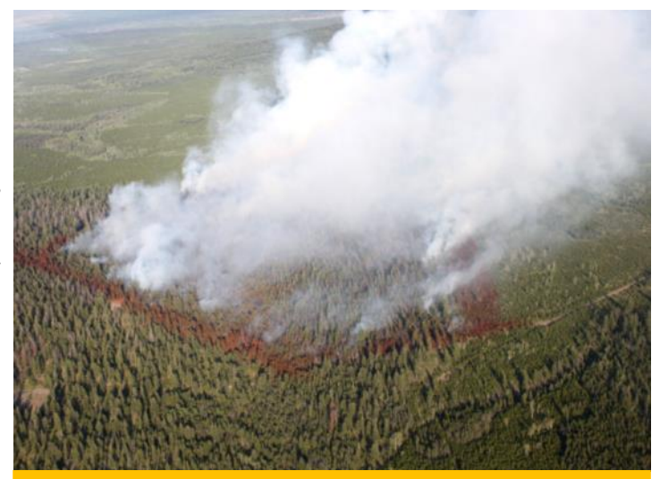
This photo is of the fire south of Alexis Lake that was discovered yesterday afternoon (C52651)

Being Held - Indicates that (with the resources currently committed to the fire) sufficient suppression action has been taken that the fire is not likely to spread beyond existing or predetermined boundaries under the prevailing and forecasted conditions.