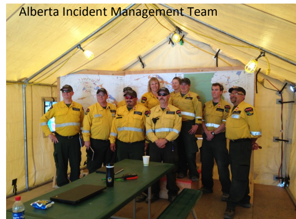
Alberta Incident Management Team