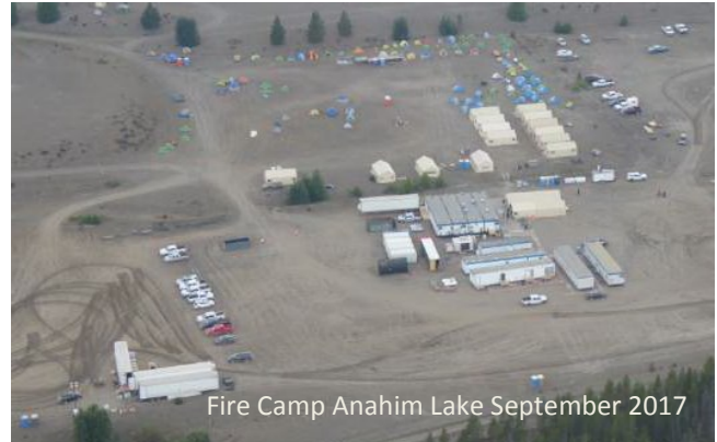
Fire Camp Anahim Lake September 2017